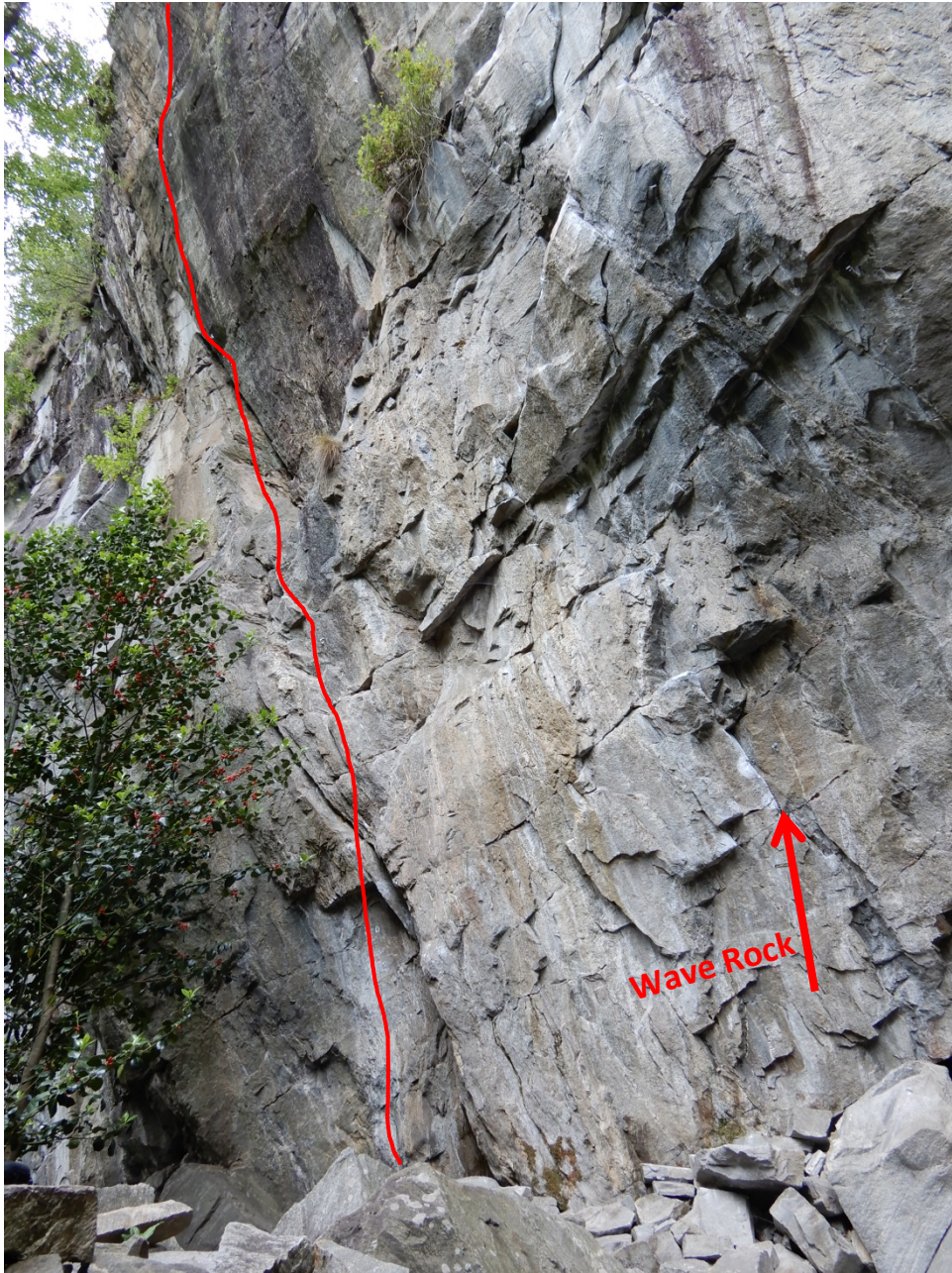
Lek Attak, 7b, 30m (to the left of Wave Rock)

The equipment has been sponsored by Picalciot and gruppo Scoiattoli Denti della Vecchia.