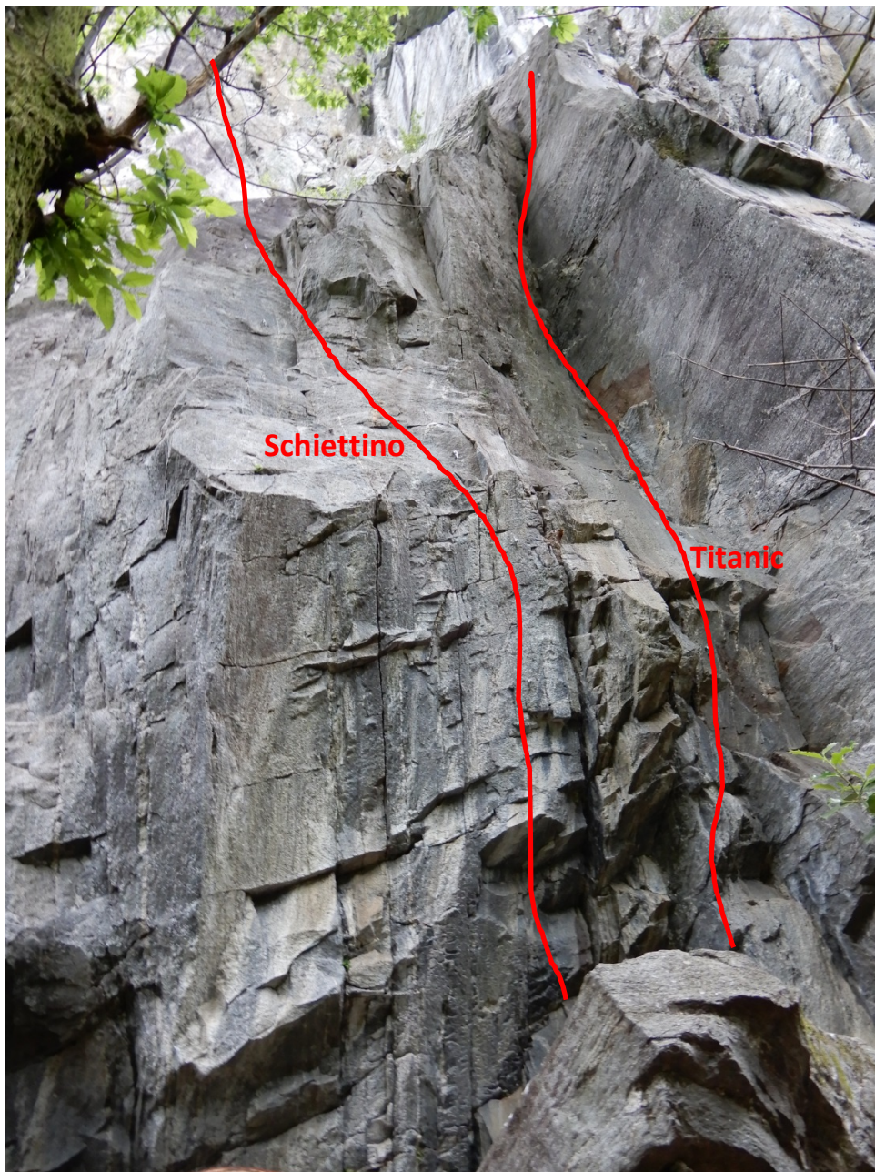
Schiettino 6b, 10m (to the right of Bagna Cauda)