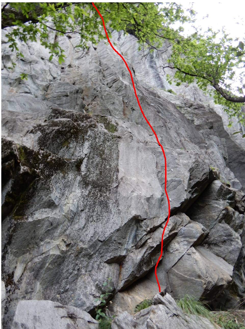
Pasternak 6c, 25m