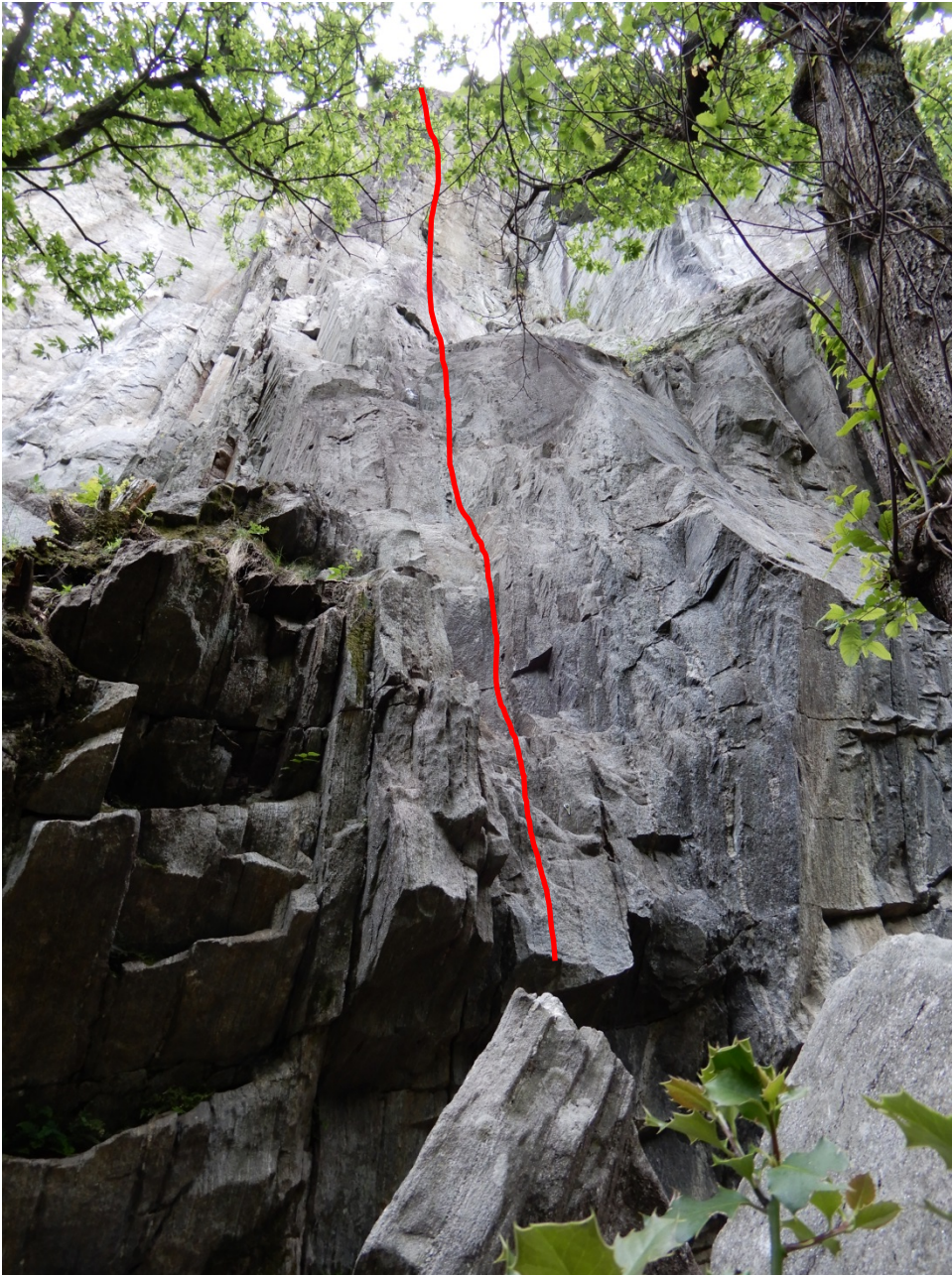
Bagna Cauda 6b, 25m (to the right of Pasternack)